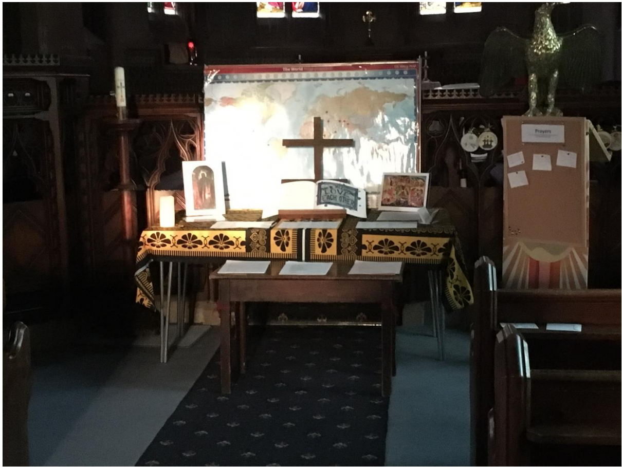
Photograph of the prayer station lit by the setting sun coming through the bell tower window

Weekly Update 2 from St Botolph's Church